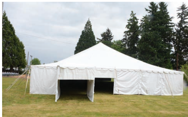
The Keizerfest tent went up on Monday, ready for this weekend's Keizer Iris Festival. For a second year, the tent is in front of the Keizer Lions Club building along Cherry Avenue, meaning part of Cherry will be closed to vehicles this weekend.

We'll transform your kitchen or bath into what you've always dreamed of