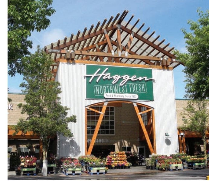
Washington-based Haggen will be the name soon on the current Albertsons in Keizer.

The conversion schedule for sh store will follow