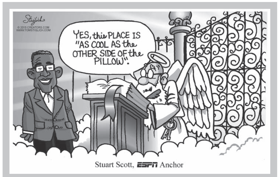
Stuart Scott, ESPN Anchor