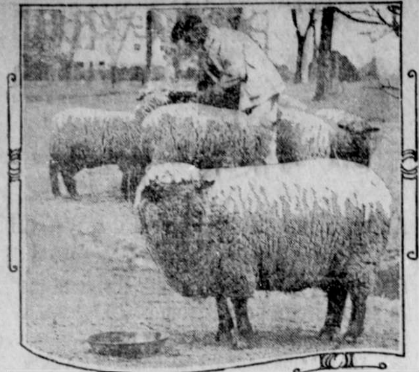
The White House lambs are lambs no more. The half dozen neecy lambkins have grown considerable until now official Washington coarges the president with having gone into the sheep-raising business. The flock has grown until it is now a gang—totaling about