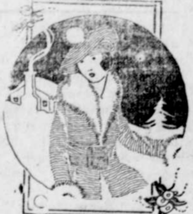
It seems rather wintry but that's because of fashion's foolish habit of showing off-season stuff. As a matter of fact this is a late winter or early spring toque and sweater for the school maid when he takes off the heavy wrap. It's uncombed wool, a belted sweater with short flaring skirt. The lighter the color the better.