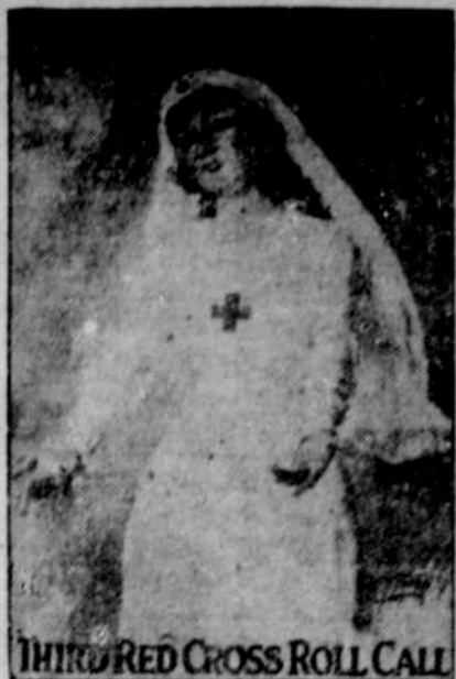
THIRD RED CROSS ROLL CALL

To men still in service, and to their families at home, to discharged soldiers not yet fully adjusted to the routine of civilian life, to 30,000 boys suffering or convalescing in Military