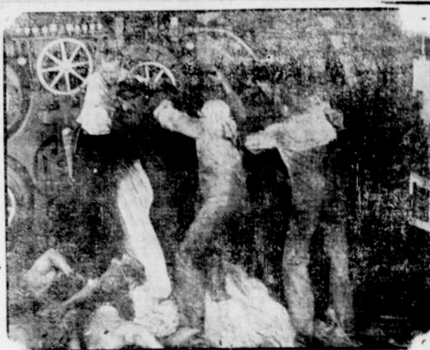
Scene from Civilization: Star Theatre Friday May 25th.

St. Helens Shipbuilding Co. launches third 5 masted auxiliary schooner. Contract taken for another lumber carrier 300 feet long with capacity of 2,000,000 feet.