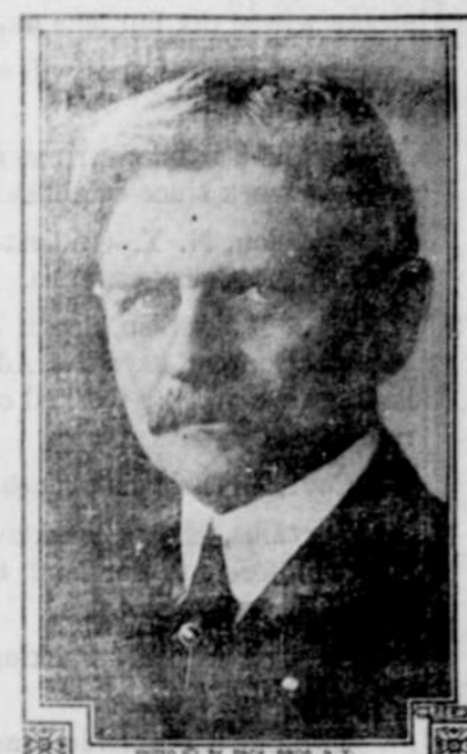
THOMAS R. MARSHALL.