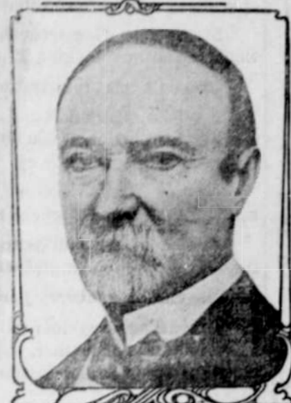
CHARLES WARREN FAIRBANKS.