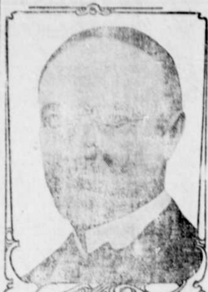
CHARLES WARREN FAIRBANKS.

Are We Really Musical? We institute music in our public schools and display our interest in it once a year—at graduation time. We see that our children take "music lessons" and judge the result likewise by their capacity to play us occasionally a very nice little piece. Men, in particular—all potential singers and very much needing to sing—look upon it as a slightly effeminate or scarcely natural and manly thing to do. Music is, in short, too much our diversion and too little our salvation.—Atlantic.