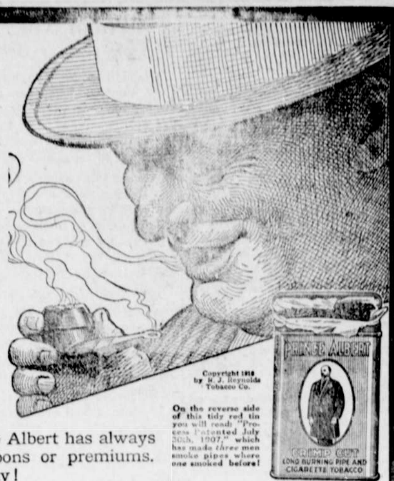
Copyright 1914 by R. J. Reynolds Tobacco Co.

Prince Albert gives you every tobacco satisfaction your smoke-appetite ever hankered for. That's because it's made by a patented process that cuts out bite and parch! Prince Albert has always been sold without coupons or premiums. We prefer to give quality!