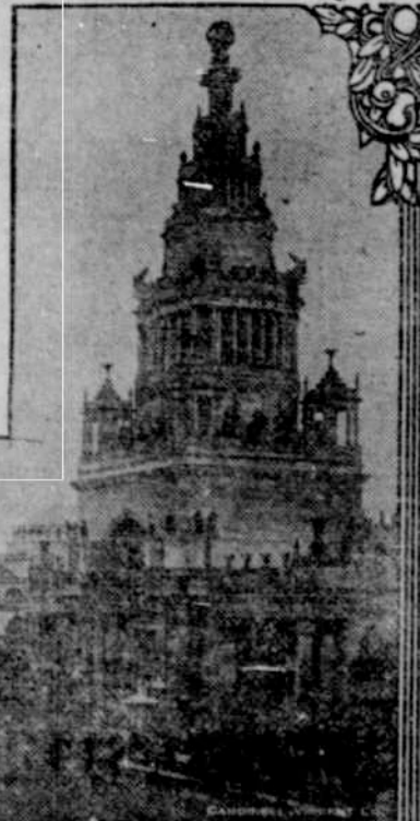
From Left to Right Are Shown the Palace of Education, Palace of Liberal Arts and Tower of Jewels.

ALL attendance records for expo- sitions were broken at the open- ing of the Panama-Pacific Inter- national Exposition in San Francisco on Feb. 20. Vast crowds thronged the grounds when President Wilson pressed the button in Washington, and each day since the attendance has been enor- mous. The huge buildings and beau- tiful thoroughfares hummed with ac- tivity and have continued to do so. The Exposition has already demon- strated at this early date that it will be a great success in every way.