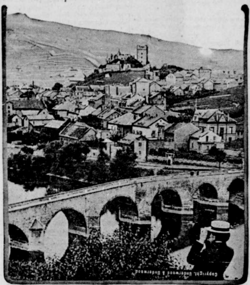
BINGEN AND THE ROMAN BRIDGE.

F IRST among the commercial rivers of civilization, the most important geographical feature of central Europe, a hotly contested boundary for more than two thousand years, one of the richest among the streams of the world in legend and folklore, and incomparable for the beauties of its course, when one calls to mind the Rhine of Germany he thinks upon one of the most important elements of the culture and the history of his race, whether he be of its Latin or its Teutonic branch. The Rhine and the Germans came upon the stage of history together, and their fates have been indissolubly bound together ever since, says the National Geographic society's bulletin. His kindred with this mighty river, Father Rhine, is one of the more conscious elements of each German's life, and to this his folklore, his literature, his war songs, his opera and his blood offerings have testified. Few geographical features have af-