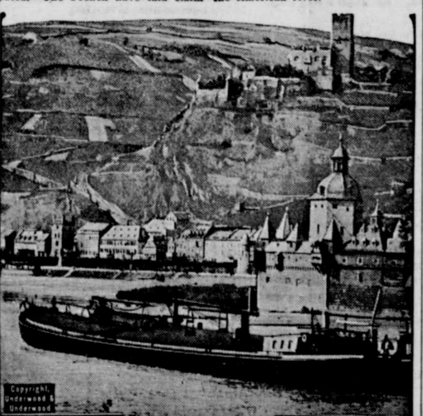
CASTLE OF GUTENFELS AND ISLAND FORTRESS OF THE PFALZ

fects the conscious life of a race so deeply as has the German Rhine. Rising in the highest Alps in central Europe, the Rhine reaches the North sea after a journey of 850 miles, and the last part of its course is through a lowland whose surface is below the tides' crest. The river gathers its water at the base of melting glaciers, plunges over great rock masses toward its lower levels, cuts through the wildest mountain valleys, traverses a wonderful high, broad plain, and then, entering its famous gorge, wanders through exquisite panoramas, through a lane everywhere mantled with ruins of historic castles, abbeys, churches, and every foot of its way celebrated by legend or history. After emerging from its gorge, it flows through a plain where powerful steel, textile and chemical industries center. Through Germany and Holland the Rhine forms the principal water avenue of central and western Europe, and an enormous commerce is handled through its ports. The Rhine is international. It is divided between Switzerland, Germany and Holland. That part of the river which lies in Germany, 450 miles in length, has been most disputed. The French have laid claim