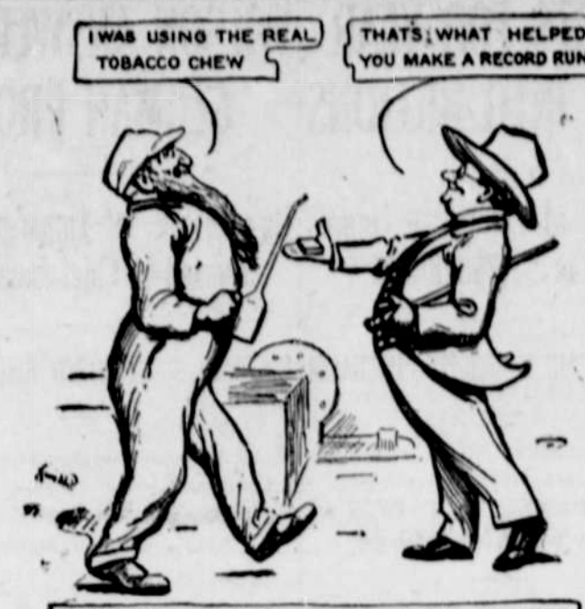
THE GOOD JUDGE CONGRATULATES THE ENGINEER

THE taste you get from "Right-Cut" is the real tobacco substance—full and rich.