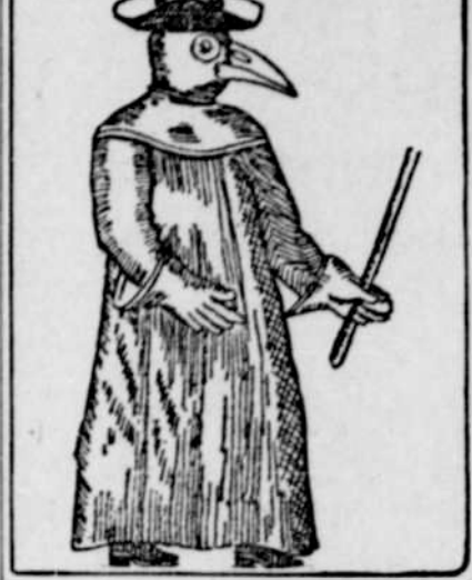
Costume of a French Physician in the Early Eighteenth Century—A Curious Combination of Foolish Superstition and Scientific Truth.

For centuries mankind had little or no accurate knowledge of the nature of disease and its causes. Among all races, at some time or other, the be-