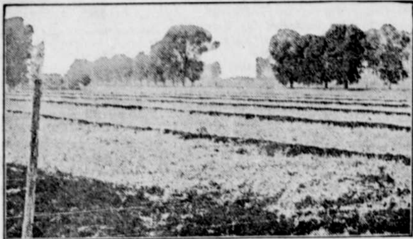
Alfalfa Seed Field With Check Ridges and Fence Lines Burned Over to Destroy Hibernating Larvae of the Chalcis-Fly.

(Prepared by the United States Department of Agriculture.)