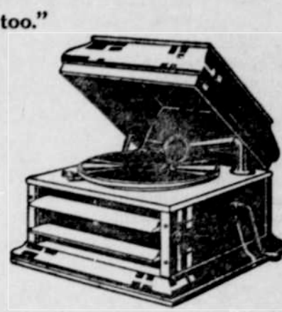
The "Columbia Jewel" Grafonola, $35-Easy Terms.

We will gladly send to your home on approval any Grafonola you select, with an outfit of records. You can decide there whether you want it or not. And we think we can meet your idea of easy terms