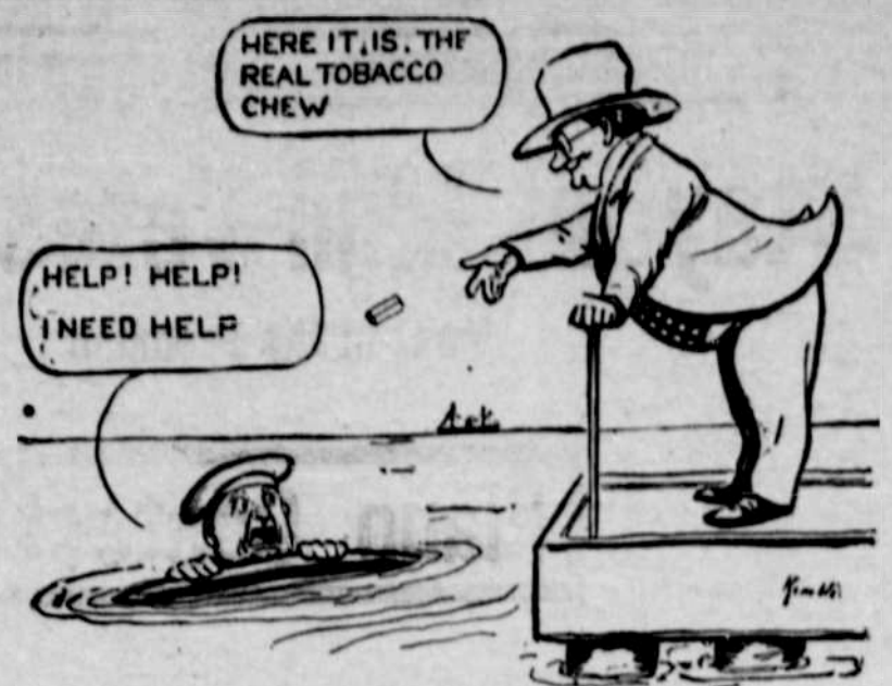
THE SAILOR HAILS THE GOOD JUDGE