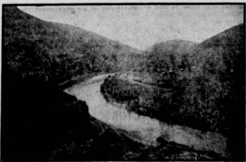
In the Deschutes River Canyon

The fight between Hill and Harriman lines for possession of Eastern Oregon presented many interesting situations. Entering the coveted territory by the Deschutes river canyon, the rival railroads pushed their lines of construction down either side of the river, one camp being ahead one day and the other the next. The above illustration shows the two crews running