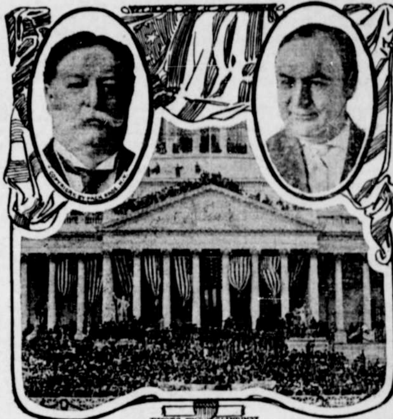
WILLIAM HOWARD TAFT AND JAMES S. SHERMAN—SCENE AT A PRESIDENTIAL INAUGURATION.