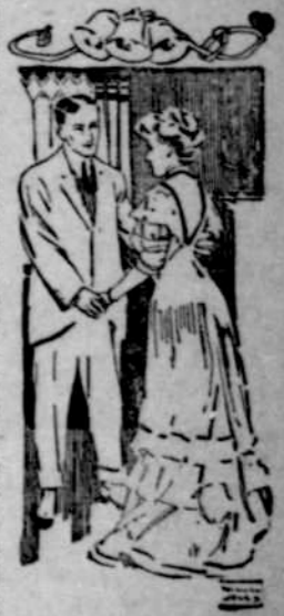
"PERHAPS SHE SAW WE LOVED EACH OTHER."