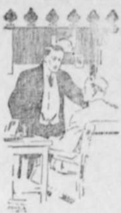
"I TOOK CONNOR BY THE SHOULDER."

"We must always be very kind and sweet to her," said Hilda.