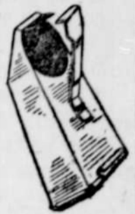
CLIPS OFF FRUIT.

With the aid of an improved fruit gatherer designed by an Indiana man, the most delicate of small fruits, such as cherries, can be severed from their stems without mutilation, infecting or soiling of the fruit in the least, and without the necessity of the hands of the person coming in contact with the fruit. As shown in the illustration, the gatherer is of a size to be easily manipulated by