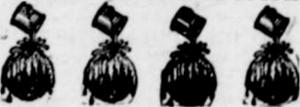
The Sherwin-Williams Paints Cover the Earth