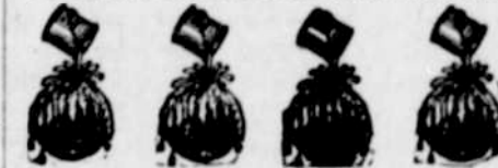
The Sherwin-Williams Paints Cover the Earth