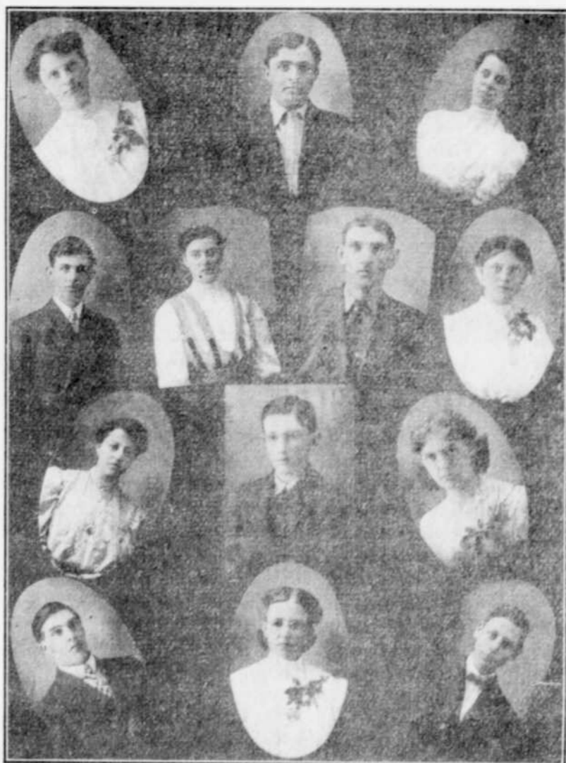
LAST YEAR'S HIGH SCHOOL GRADUATING CLASS.

The general condition of the poultry industry in Marion county at the present writing is most satisfactory to the breeders. Prices for eggs and poultry the past year have been very satisfactory.