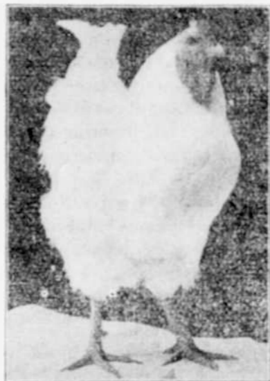
A STAYTON WHITE WYANDOTTE.

Oregon has the lowest death rate of any state in the union.