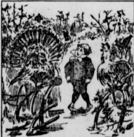
"What shall we do with him, granda?" asked the gobbler.—Harper's Young

You can hardly find a home without its Ayer's Cherry Pectoral. Parents know what it does for children: breaks