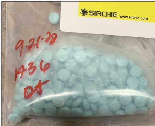
Fentanyl allegedly found at a residence in Redmond Sept. 21.