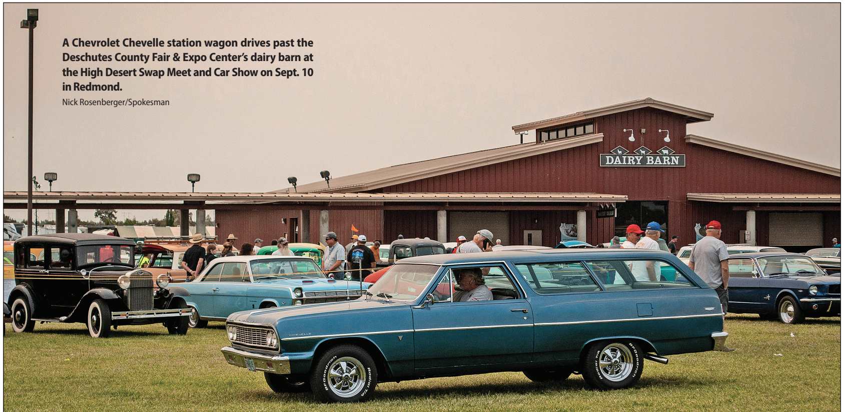
A Chevrolet Chevelle station wagon drives past the Deschutes County Fair & Expo Center's dairy barn at the High Desert Swap Meet and Car Show on Sept. 10 in Redmond.

According to Ramsey, the car swap has always been very suc-