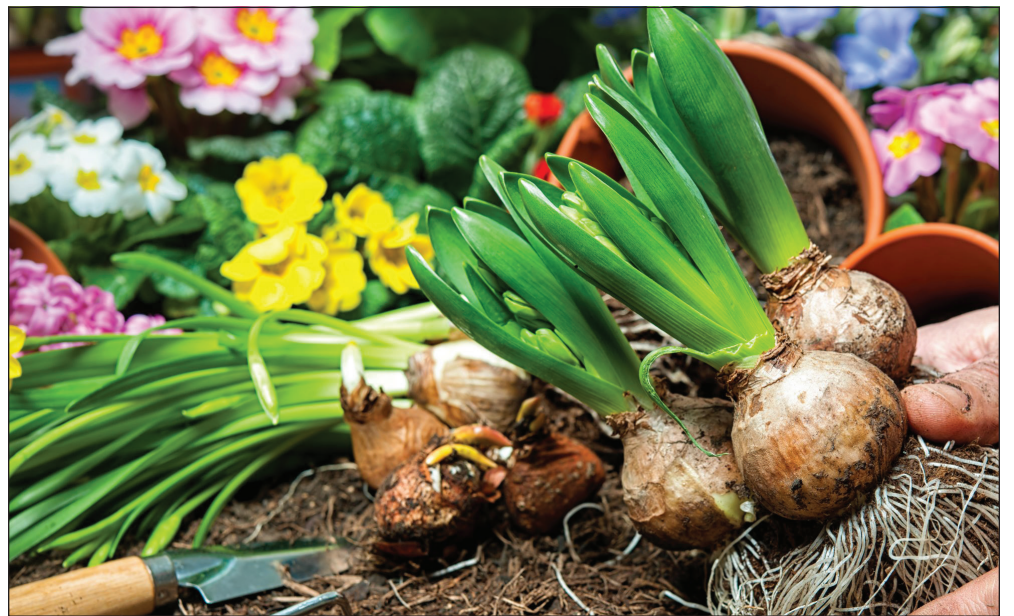
Bulbs make a more impressive statement if multiple bulbs of the same variety are planted in a group rather than planted like soldiers in a straight row.