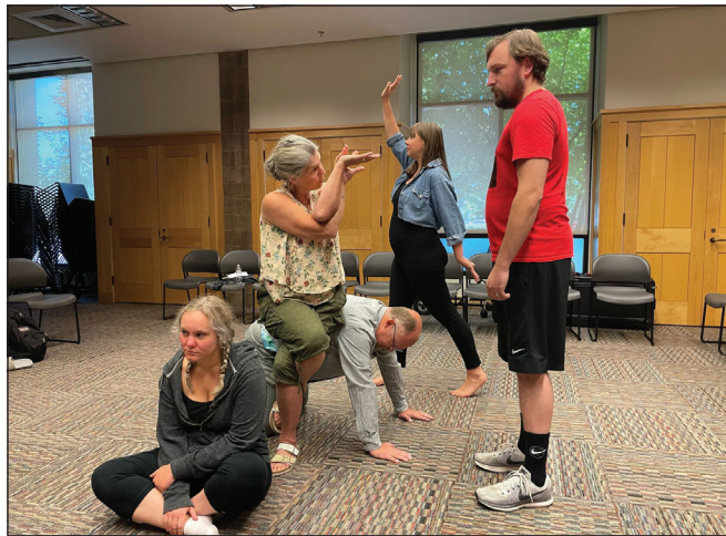
Cast members rehearse a scene from Annie Baker's "Circle Mirror Transformation."

Playwright Annie Baker "has a specific style in her writ-