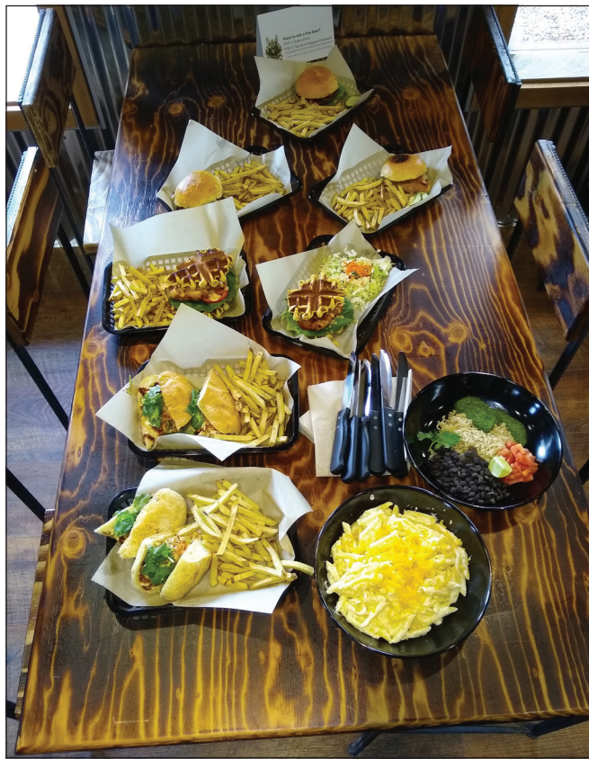
A variety of food is available at Initiative Brewing. The new brew pub opened May 24 at 424 NW 5th Street.

If you're in the mood for a refreshing and light appetizer, do try the strawberry and feta salad, $12. A mixture of wild greens, thinly sliced cucumber, crumbled feta cheese, strawberries, and toasted almond, this salad is served with delicious black pepper vinaigrette on the side. If