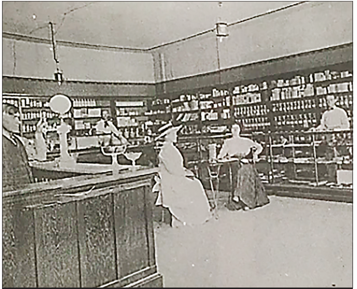
Patrons enjoy the soda fountain at the old Lynch & Robert Drug Store in this photo taken July 13, 1911.