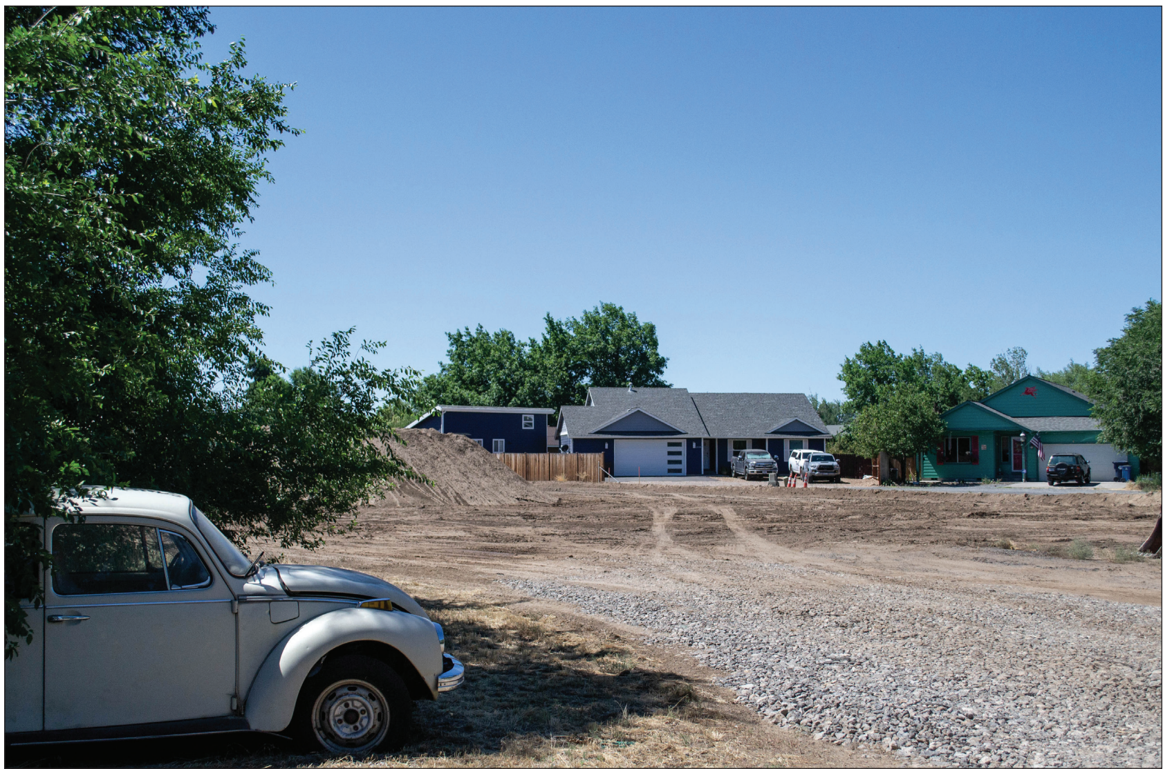
The site where construction recently began between SW Salmon Ave. and SW Odem Medo Way in Redmond.

The new roadway will curve into the Odem Medo intersection and require traffic to reduce speed as cars transition into a left turn