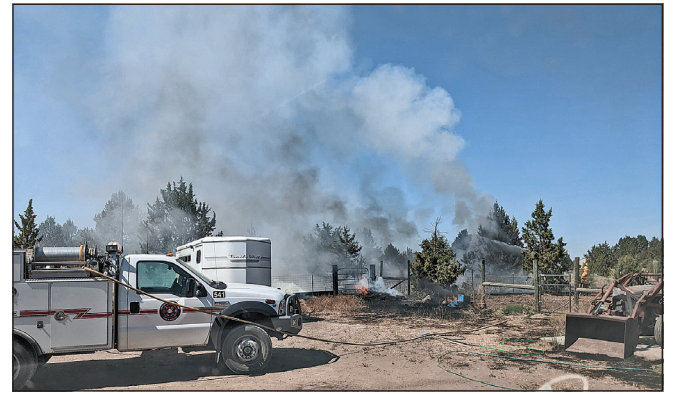
A small brush fire broke out Tuesday afternoon in Crooked River Ranch. Crews were able to limit it to less than a half acre in size.