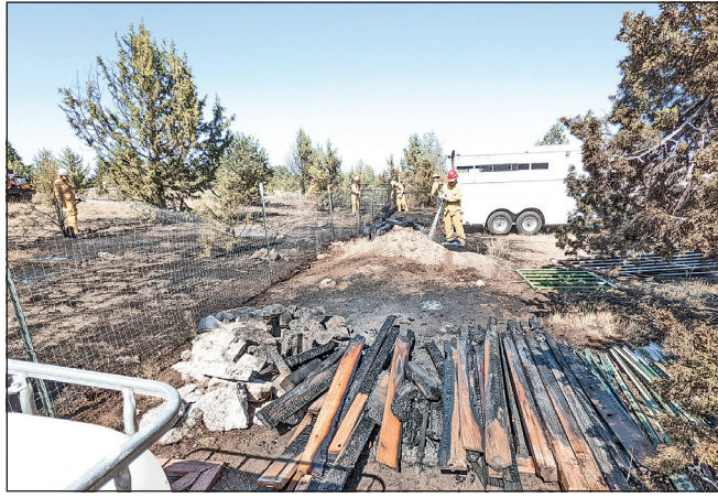
The fire destroyed a lumber pile located near a residence on SW Peninsula Drive in Crooked River Ranch.

July 19, was declared contained at about .33 acres about 30 minutes later. Crews remained on-scene mopping up and building fireline around hot spots until nearly 6 p.m., according to CRRFR. Six engines and 17 firefighters responded, including mutual aid from Redmond Fire & Rescue, Bureau of Land Management, Oregon State Fire Marshal's Office and Jefferson County Sheriff's Office. The cause of the fire is under investigation. Reporter: ttrainor@redmondspokesman.com