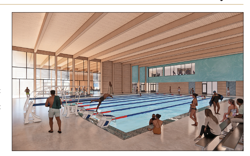
Rendering of the pool area of the proposed Redmond Recreation Center. The Redmond Area Parks and Recreation District is looking to pass a $49 million bond in November to fund construction of the new facility.

The swim center was built in 1979, when Redmond's population was just 6,500 people. Today, the park district serves roughly 45,000 people in Redmond, Terrebonne, parts of Crooked