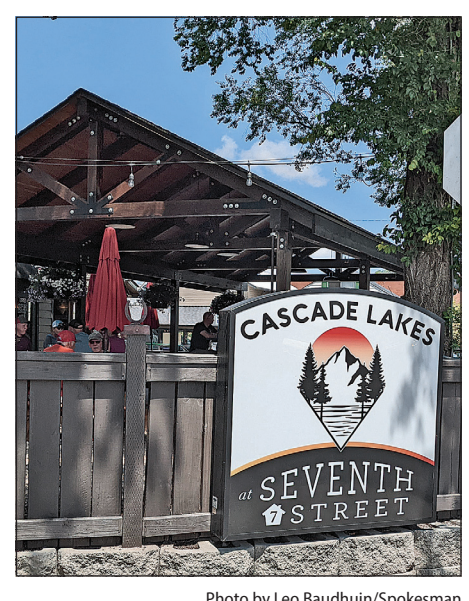
Cascade Lakes brewery in Redmond will host "Pups on the Patio" July 24.