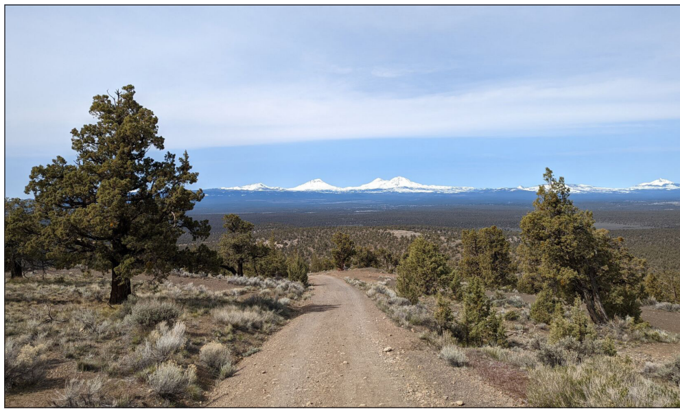
A view of the mountains at Cline Buttes.

Cline Buttes has undergone several changes in the last few years, for better or worse. Be sure to stay up to date on the latest closures, access points and trail locations. It can also be confusing since there are several roads, unauthorized trails, and power line corridors that crisscross the more established routes. Always be prepared with a map and communication at the very