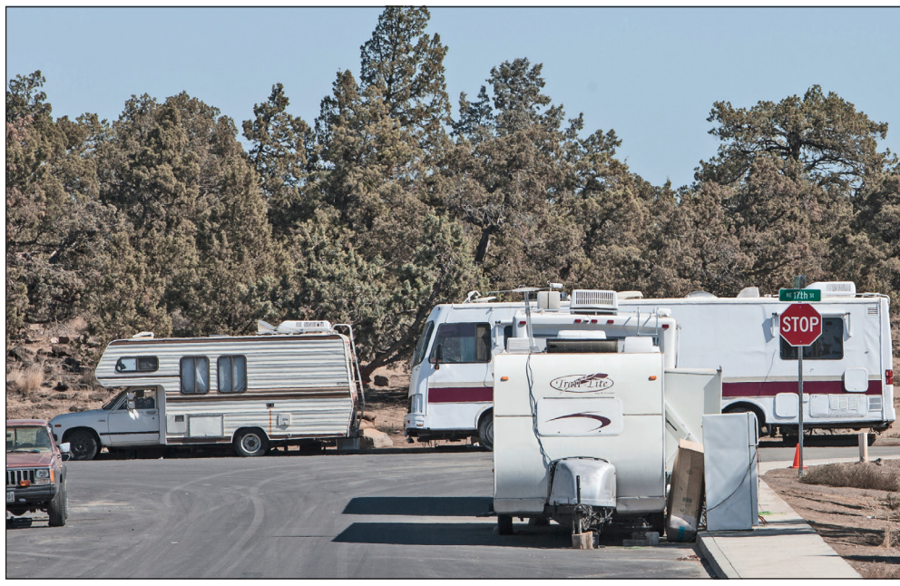
Campers park at the intersection of 17th Street and NE Greenwood Avenue in Redmond in September 2021.