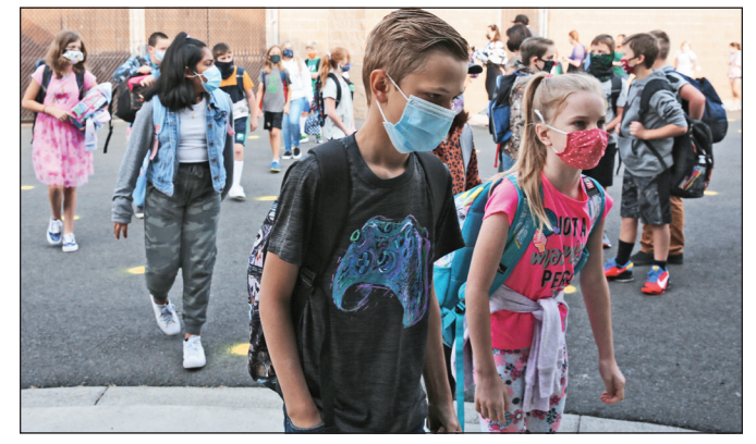
Students wear masks as they file into Sage Elementary School on the first day back to school in Redmond.

Coffee is on from 7 a.m. to 4 p.m. 7 days a week. For more details, see their website at www.junctionroastery.com ■ Editor: 541-633-2166.