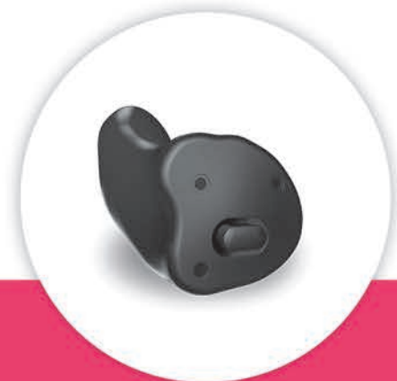
New Rechargeable Inzio AX