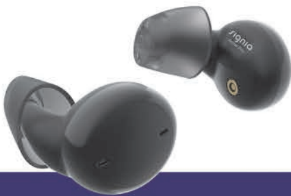
Signia Active Pro

Strengthen your relationships with hearing aids you'll love. $1,000 off** a pair of top models like these: