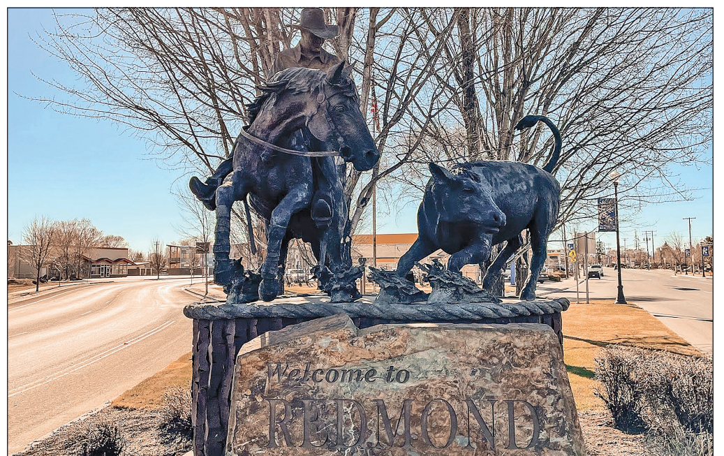
Greg Congleton's "Western Swing" welcomes visitors to Redmond's north end, one of 64 pieces of public street art in city.

The Redmond Museum of Art covers a vast amount of real estate. One could walk it