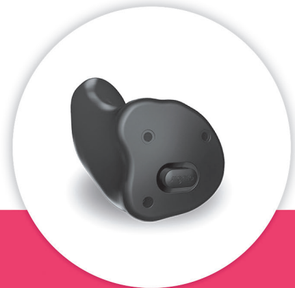
New Rechargeable Insio AX