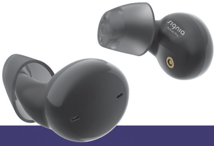
Signia Active Pro

Strengthen your relationships with hearing aids you'll love. $1,000 off** a pair of top models like these: