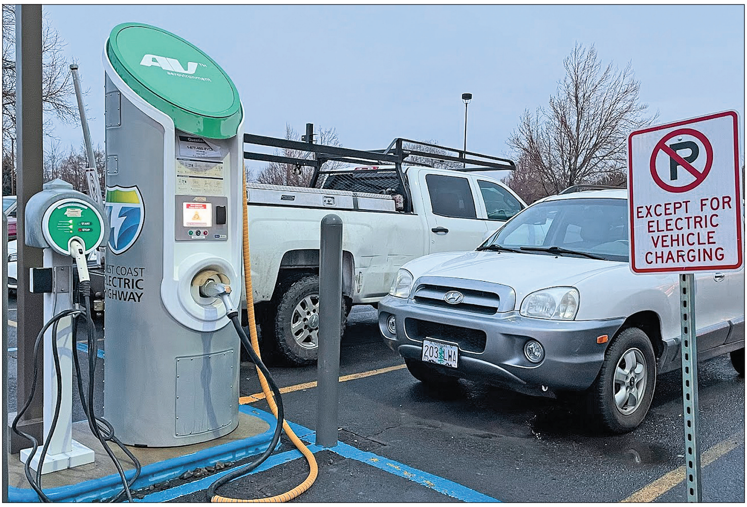
Rapid charging at Fred Meyer 'fills' your electric tank by the time you finish shopping.