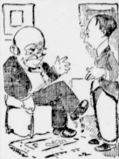
Often the Case.

"Can you support my daughter in the manner to which she is accustomed?" "I don't know whether I can or not, but she's willing to take a sporting chance."—St. Louis Globe-Democrat.