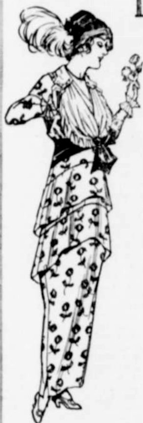
Waist 6654 Skirt 6655

Of course it's a Butterick style. And that means you can be wearing it months ahead of your neighbors. You can have it made up inexpensively in cotton crepe, ratine or duvetyne, or in silk crepe de Chine, charmeuse, taffeta, broché, etc. We are now showing the loveliest new Butterick styles and the very latest materials for reproducing them exactly. Call for the newest Butterick Fashion Sheet. It is yours FREE.