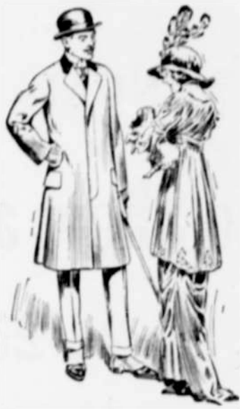
BRANDGEE KINCAID & CO. CLOTHES

We are showing in our ladies' ready-to-wear depart- ment up-to-date tailored suits made from fabrics that are entirely new this season, neatly trimmed, carrying out the recent ideas of the world's fashion makers.