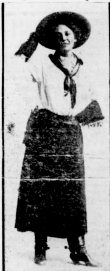
Cowgirl with Wild West Show

The Wild West Show that is to exhibit here the 13th will draw an immense crowd to this city. As far away as Burns in Harney county the people are coming. The show is said to be one of the best going in