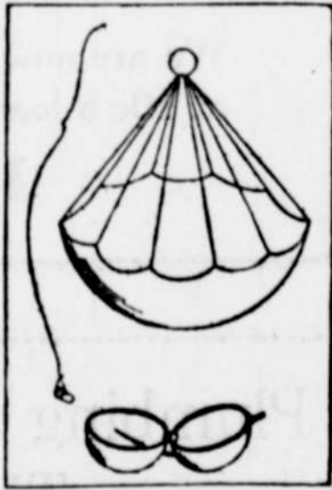
New Parachute Toy.

An amusing toy has been devised by two Indiana men. It consists of a globular casing, hinged at one point and held closed by a catch. Inside this casing is packed a parachute, with a small ball for a weight. The catch of the receptacle is held shut by a pin, which is unwound and allowed to lie loose on the ground so it will pay out freely and the ball thrown as high into the air as it will go. When it comes to the end of the cord the pin will be jerked out and the shell will fly open. This will release the para-