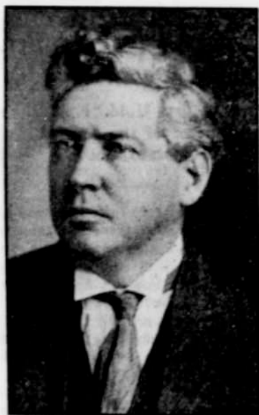
N. J. SINNOTT Progressive Republican candidate for Congress, with the interests of Eastern Oregon uppermost.