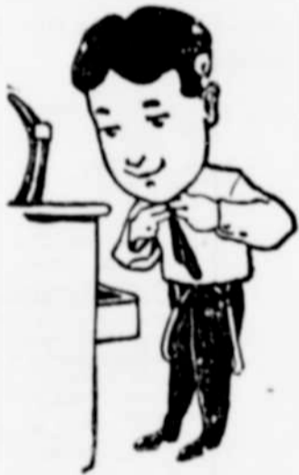
Our ties and collars work together well.

Silk handkerchiefs, fine neck ties, mufflers, nice sox, etc. Do not overlook this department.