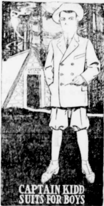
CAPTAIN KIDD SUITS FOR BOYS

If your boy is rough on clothes, practice a little practical economy and buy a Captain Kidd Manly Suit. It is built particularly for the lad rough on clothes, and its appearance is stylish in every sense of the word.