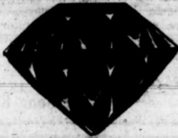
SOLITAIRE DIAMOND RING

Show us the man or woman, boy or girl who would not like to possess such a jewel and we will show you one who has absolutely no sense of the beautiful. You must see it in order to appreciate it! Purchased from and on exhibition at M. L. Smith, Jeweler, 193 Broadway, Portland, Oregon.