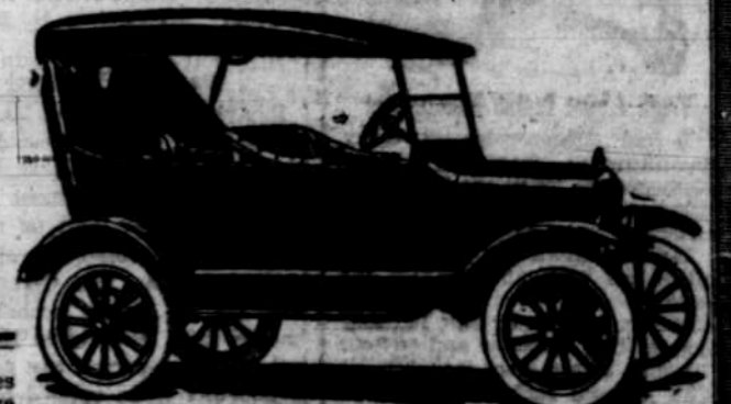
Henry Ford's 1923 Masterpiece, to be Given as Third Prize