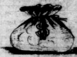
SIXTH PRIZE—$100 in Gold SEVENTH PRIZE—$50 in Gold EIGHTH PRIZE—$25 in Gold