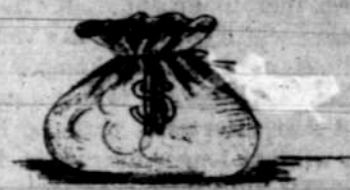
FIFTH PRIZE—$150 Radio Set

SIXTH PRIZE—$100 in Gold SEVENTH PRIZE—$50 in Gold EIGHTH PRIZE—$25 in Gold