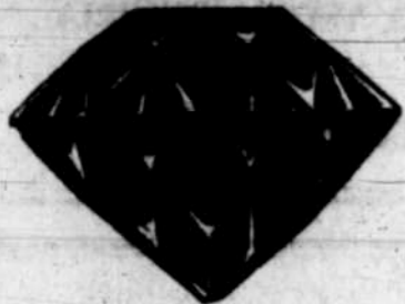
SOLITAIRE DIAMOND RING