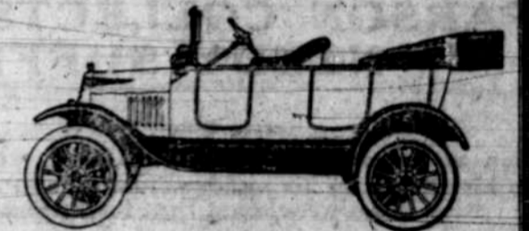
Henry Ford's 1923 Masterpiece, to Be Given as Third Prize