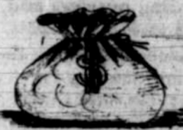
FIFTH PRIZE—$150 Radio Set

SIXTH PRIZE—$100 in Gold SEVENTH PRIZE—$50 in Gold EIGHTH PRIZE—$25 in Gold