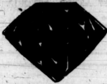
$200 Diamond Ring, Fourth Prize